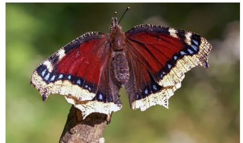
Images of a Mourning Cloak (nymphalis antiopa) caterpillar and butterfly (found online)