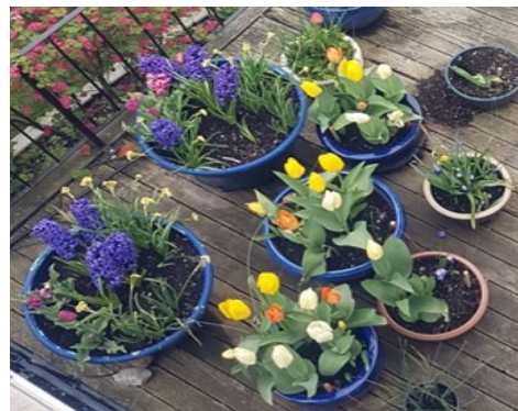
...blooming from tender stem hath sprung Traditional German carol (Praetorius)

teams, but a major opportunity to build your social calendar for the year in one night. Watch for announcements explaining how to offer an auction item, volunteer to help stage the auction & dinner, or when and where to buy your admission ticket.