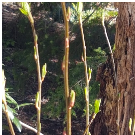
The force that through the green fuse drives the flower Dylan Thomas