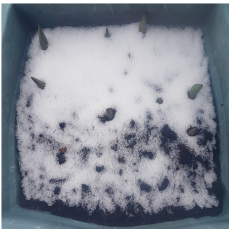
Water under snow is weary... Eha Lättemäe

I'm reminded of these lines by Emily Dickinson as I write my column amidst the winter white-out of Valentine's Day. My spring bulbs are sleeping in their containers, albeit with a few green tips poking above the snow encrusted on top of the soil.