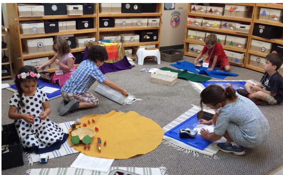
Children in Spirit Play class