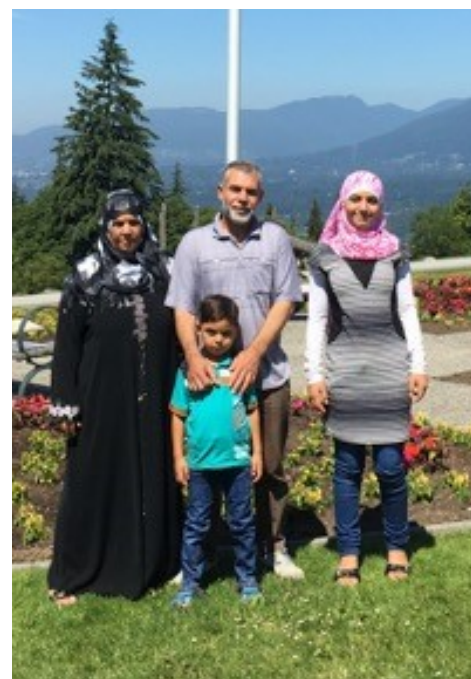
The family standing in front of a Canadian flag