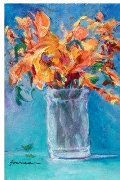
by Lynda Fownes

Thank you to all who shopped at our Craft Sale in November — our best sale ever! In January, the Sanctuary display will again feature NSUC artists.