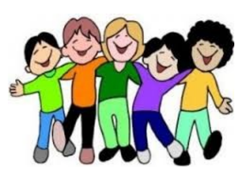
Spirit Play (3-6 years)

Let's walk through the door together. Here is what is happening for our youngest NSUCers this fall.